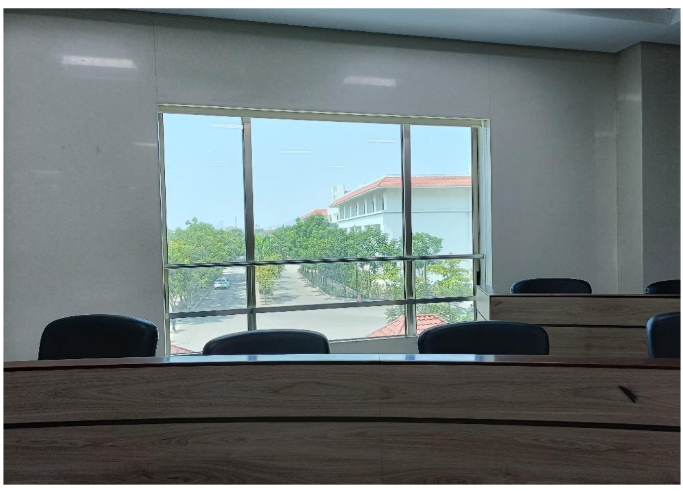
Fig 26: Effective light System