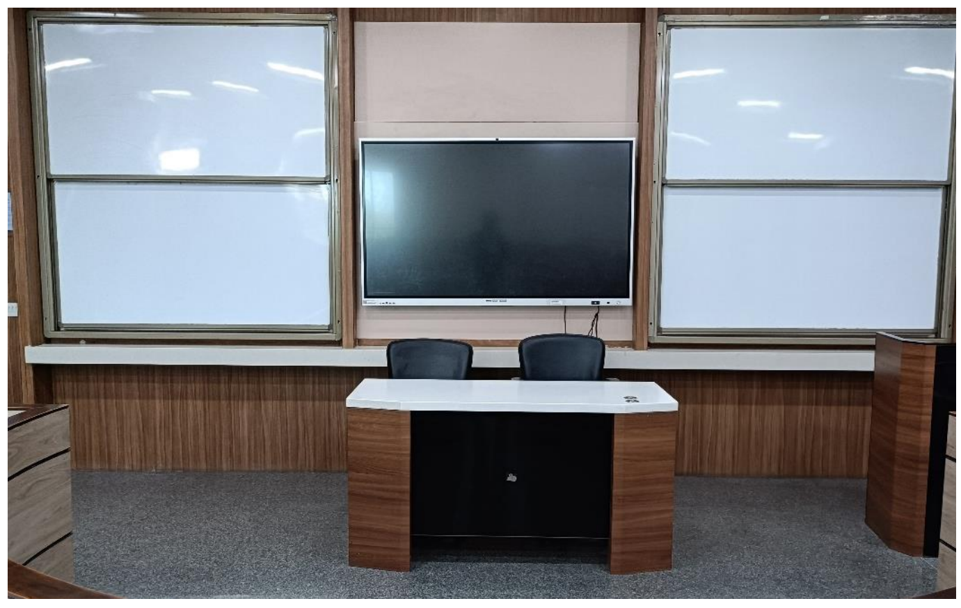
Fig 20: Senses Smart Board