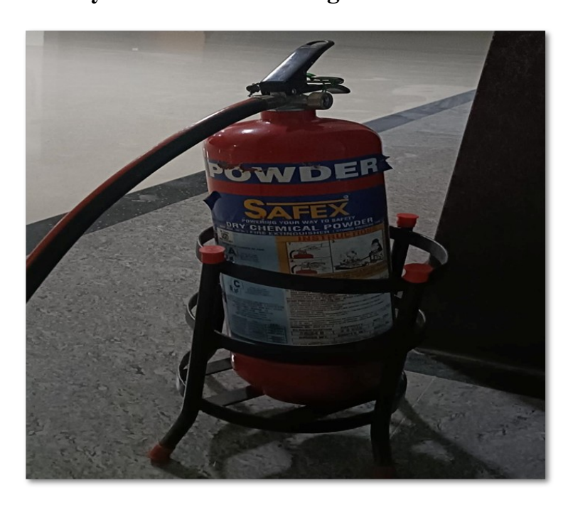
Fig 24: PA Systen in each classroom and Fire extinguisher near Classroom