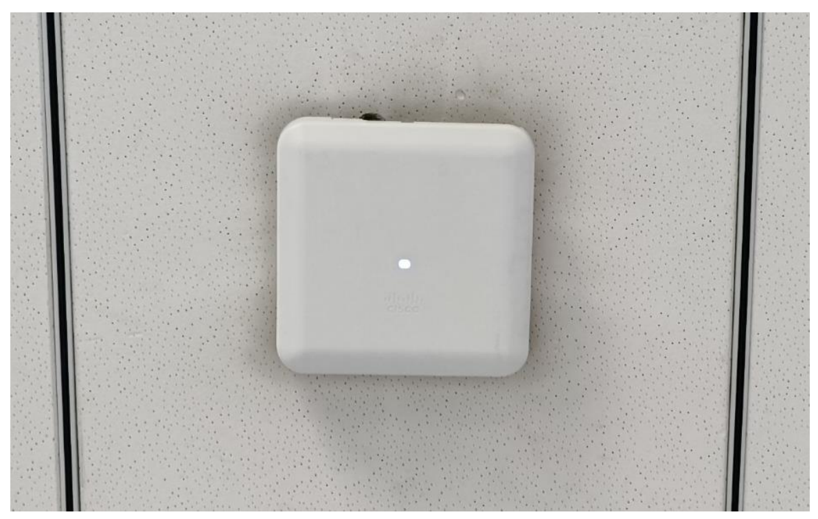
Fig 22: Wifi- Router