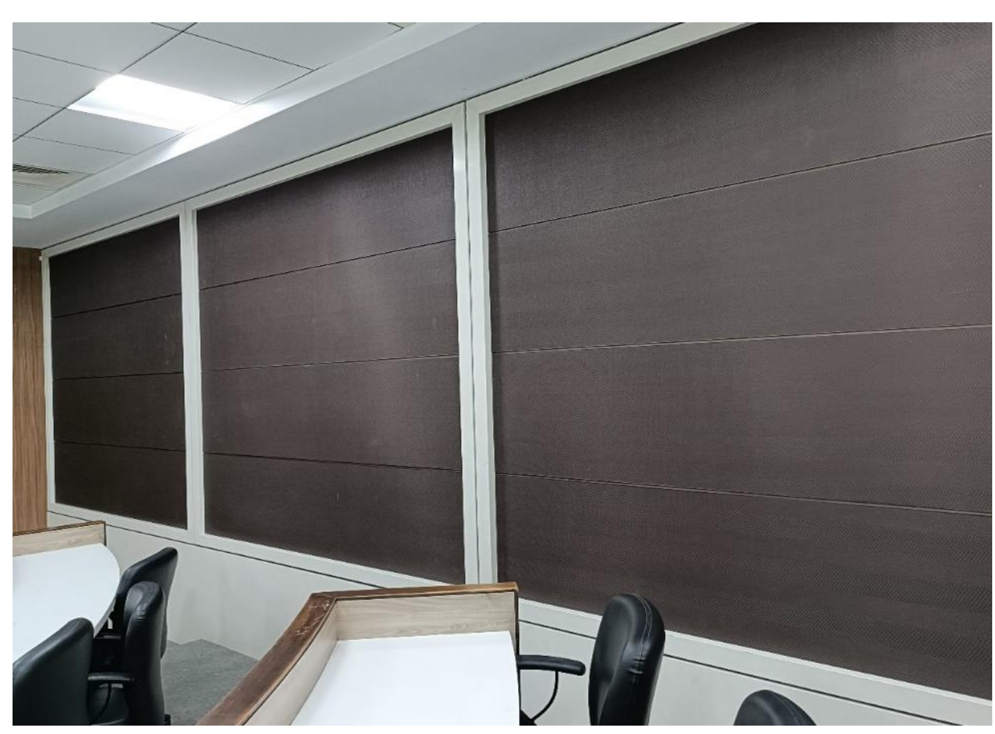
Fig 25: Sound proof Wall