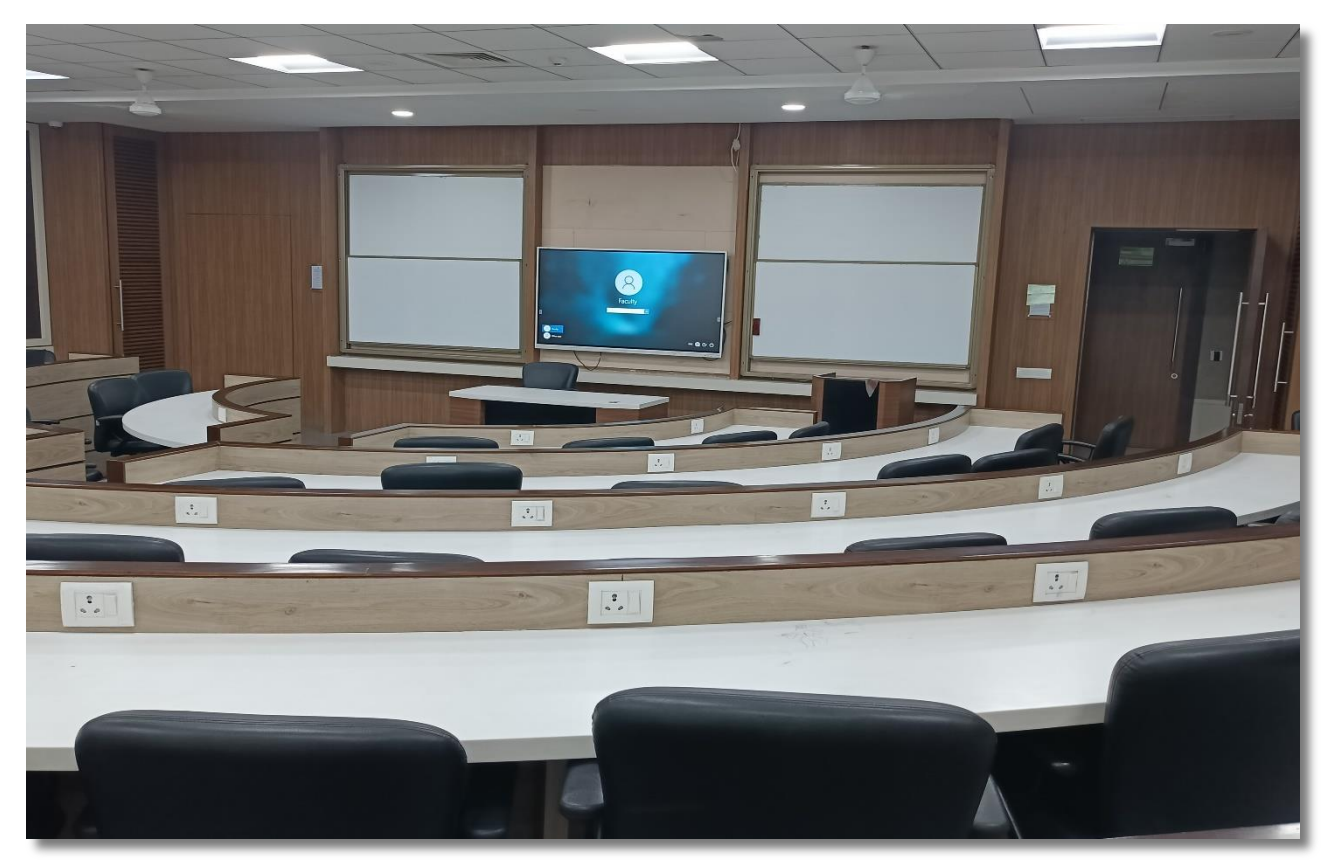
Fig 4: Classroom4 (210)