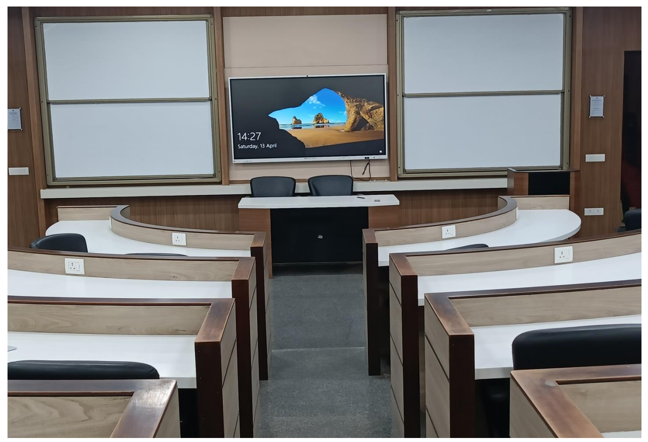
Fig 3: Classroom3 (209)