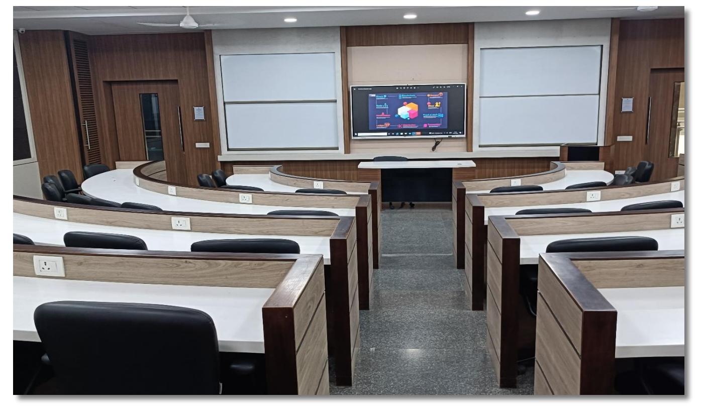
Fig 2: Classroom1 (208)