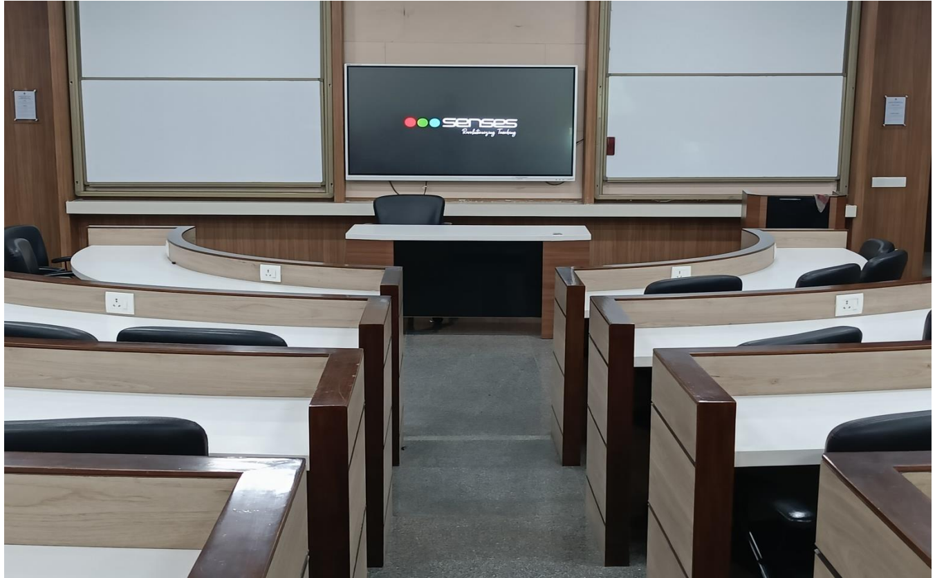
Fig 1: Classroom1 (205)